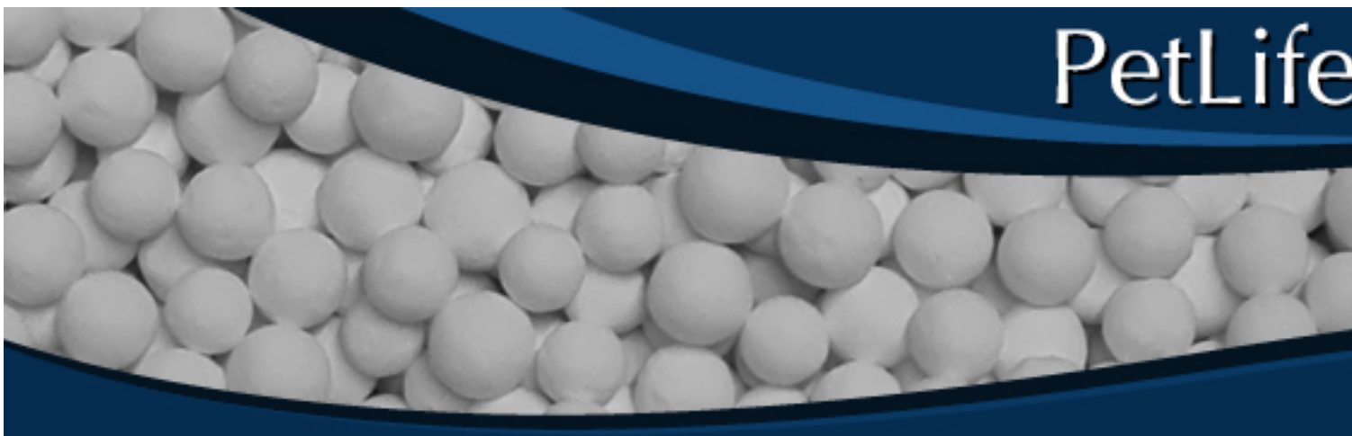
PetLifeElite R CeramicBalls TM

Â Â PetLifeElite R PFO PelletsFerricOxide TM