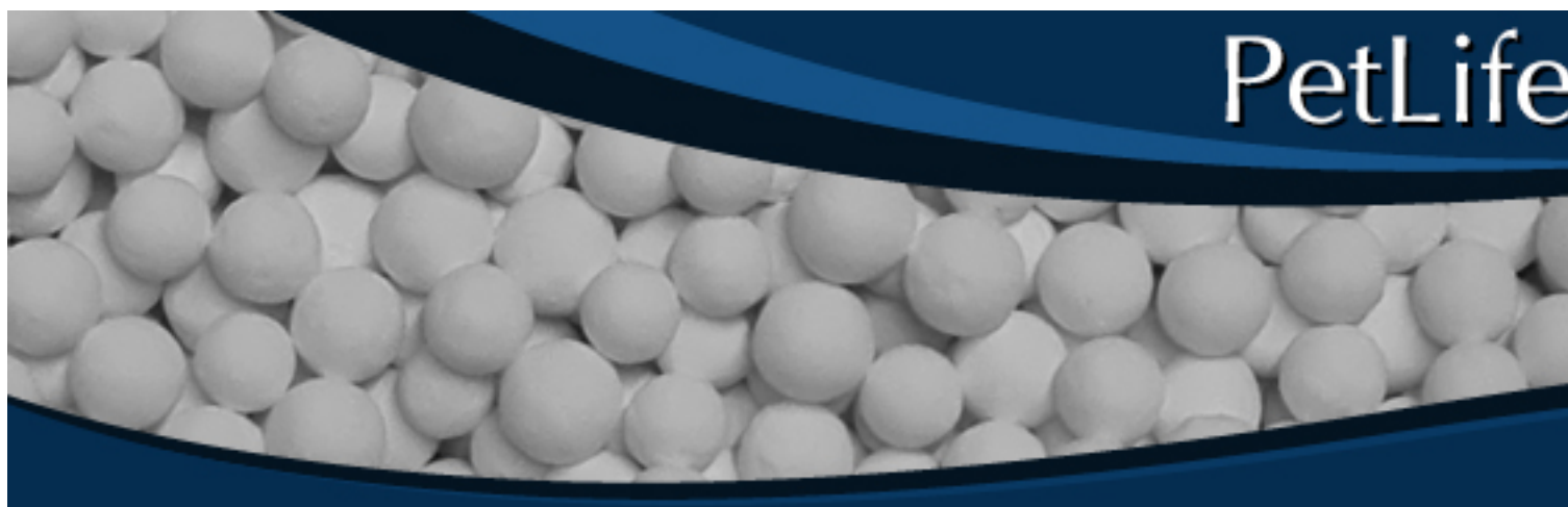
PetLifeElite R CeramicBalls TM

Â Â PetLifeElite R PFO PelletsFerricOxide TM