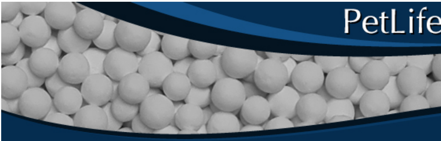
PetLifeElite R CeramicBalls TM

Â Â PetLifeElite R PFO PelletsFerricOxide TM