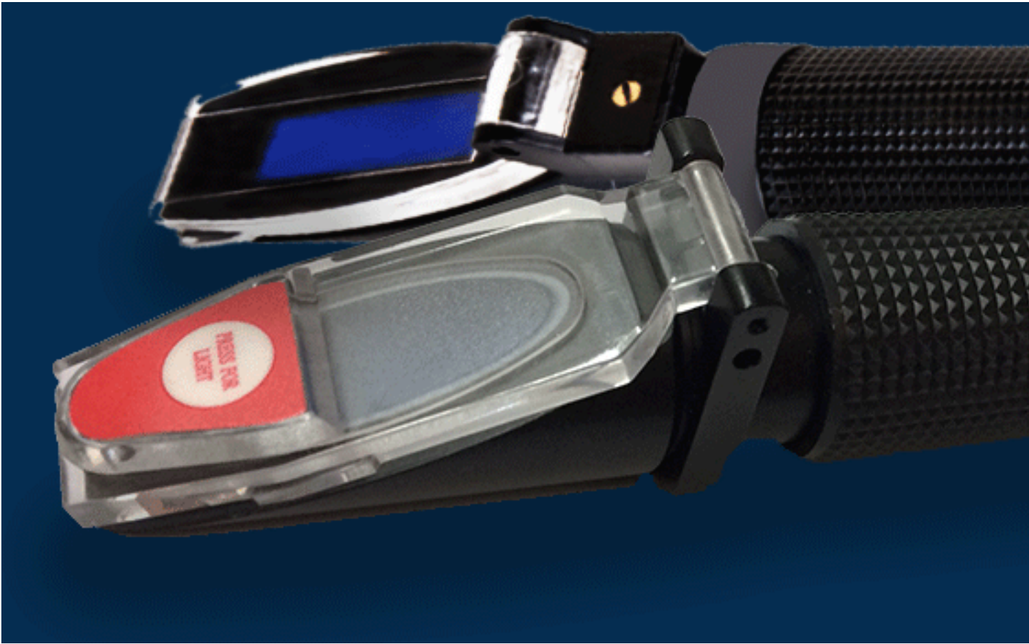
ReefLifeElite ® RHS Refractometer ™

Number pieces in packaging:1 Number pieces in box:25 Customer Reviews: There are yet no reviews for this product. Please log in to write a review.