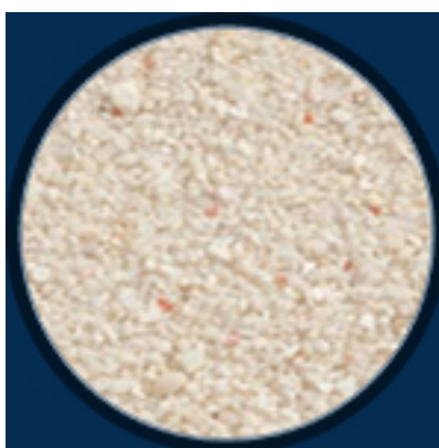
Â Â ReefLifeElite R CoralSands1 TM

ReptileLifeElite R ReptileStructure DesertPad TM